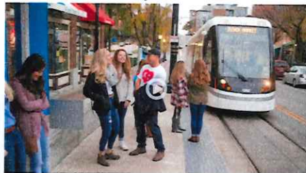
The Kansas City Streetcar's Main Street Extension is set to start on Wednesday, October 24, 2023, at 12:30pm. The line will run from the 30th Street station to the 12th Street station.

"It feels like it sort of opened up access to the city," Duff said.