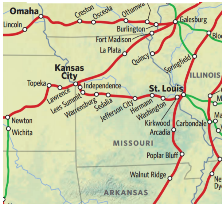
Figure 3. Regional Amtrak Connections from Union Station