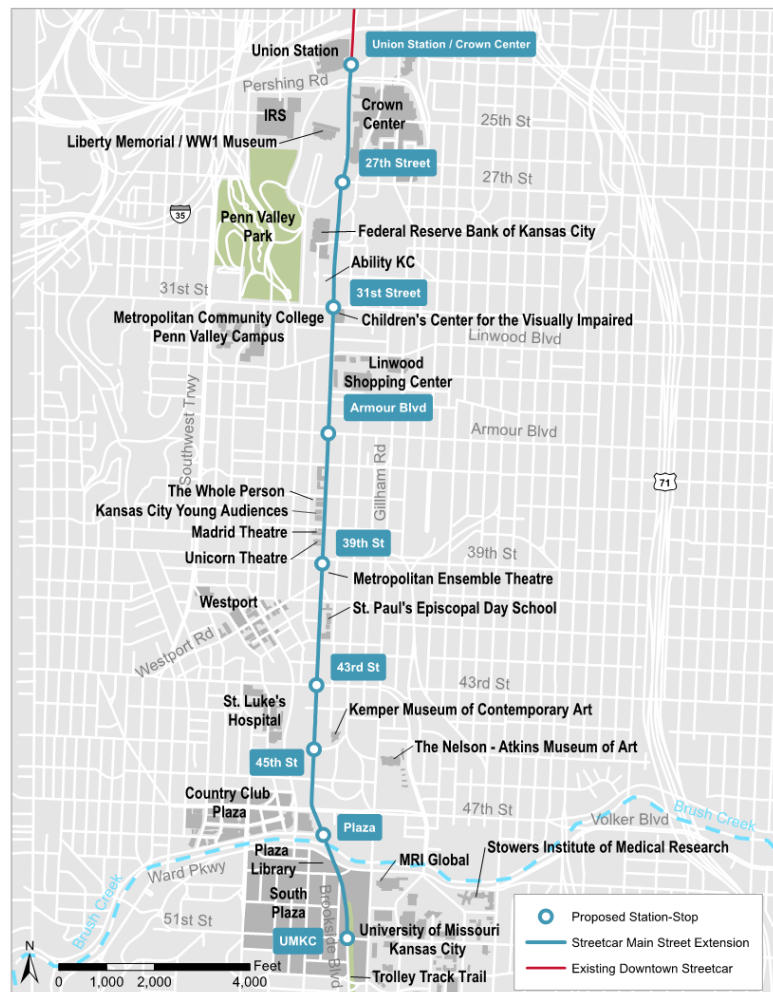
Figure 1. Proposed Kansas City Streetcar Extension