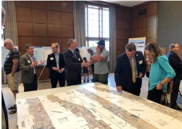
Images of participants at the June 5 second Open House at St. Paul's Episcopal Church (located along the extension).

The public-feedback focus of the second Open House was to receive input on why participants preferred a center vs. outside running streetcar for the entire length of the extension. Two roll-plot maps were on display – allowing participants to see the anticipated tradeoffs for each option. A key focus of many participants was access to driveways and/or left-hand turns at key intersections. Team members gathered feedback received via sticky-notes requesting participants describe "why" they prefer, placing their note on either the Outside- or Center-Running poster boards. Below are additional details from the comments received.