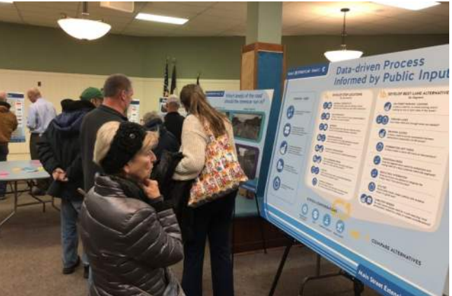
Images of participants at the April 3 Open House at Community Christian Church (located along the extension).

The public-input focus of the first Open House event was to receive feedback on: